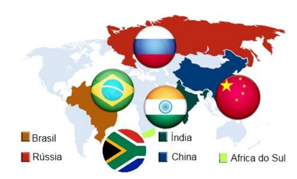
Figure 1. The BRICS member states

The five member states of the BRICS alliance (Figure 1) are believed to be emerging economies and are usually associated with countries that used to have underdeveloped economies but subsequently recovered and have started to accumulate wealth – accompanied by important structural changes on an economic and social level [11].